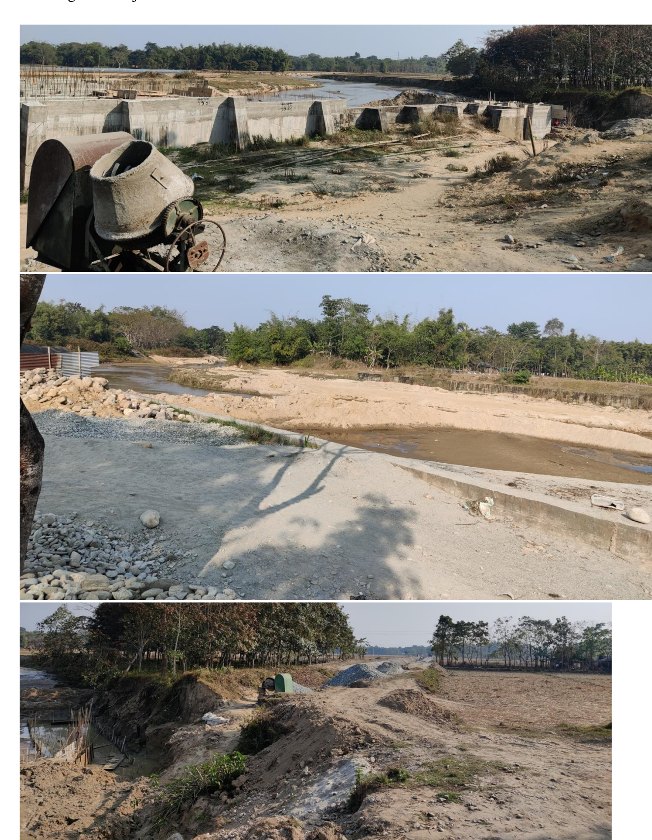
Figure 8: Under-construction Spillway discharging and diverting water from Chandna River to B3M at chainage 16760 m.