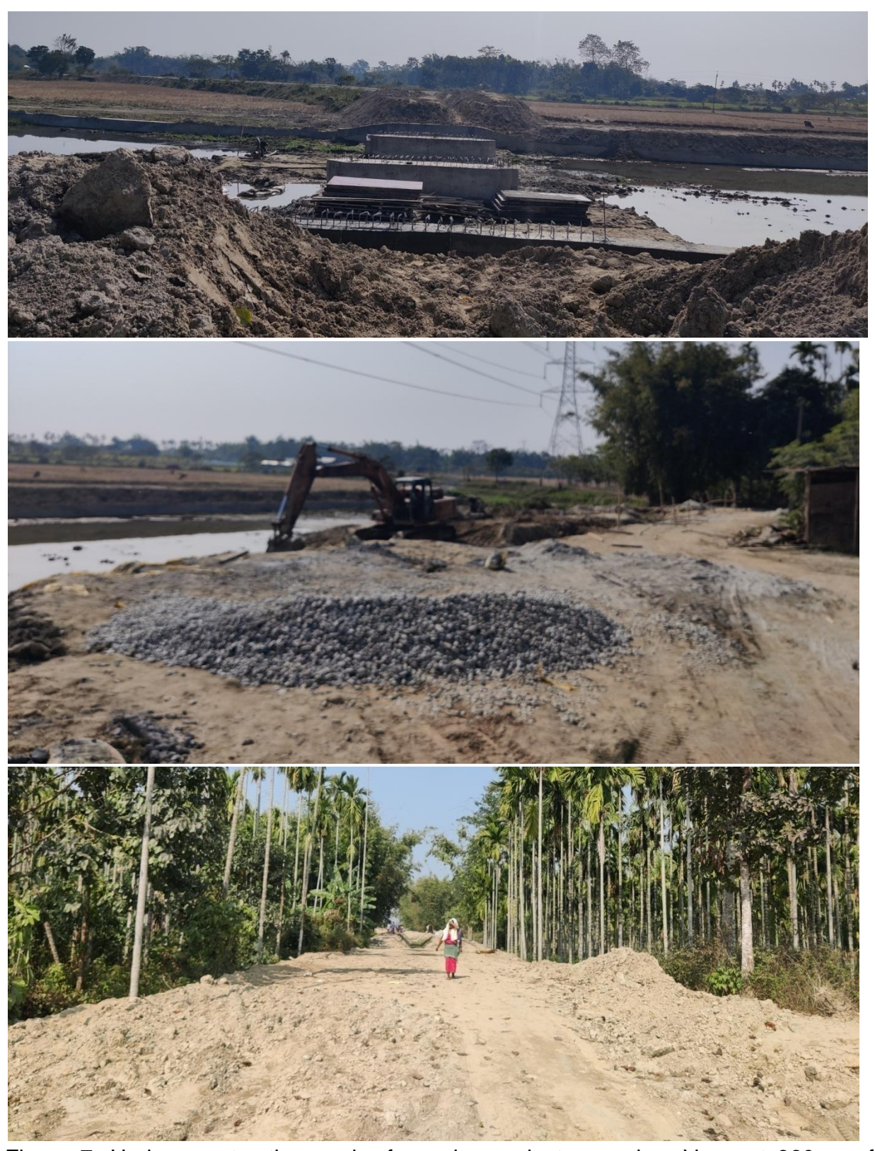
Figure 7: Under construction work of canal aquaduct over river Voga at 960 m of K2B2M.