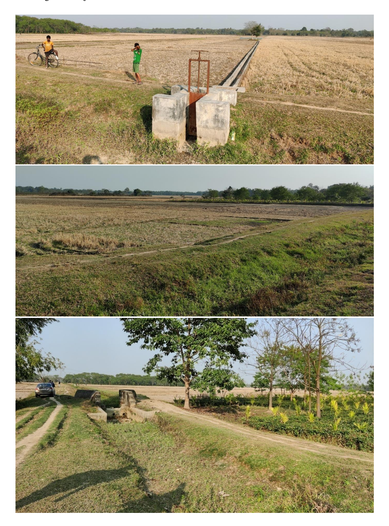
Figure 9: CAD&WM works on canal D1B3M at Chainage 12900 m.