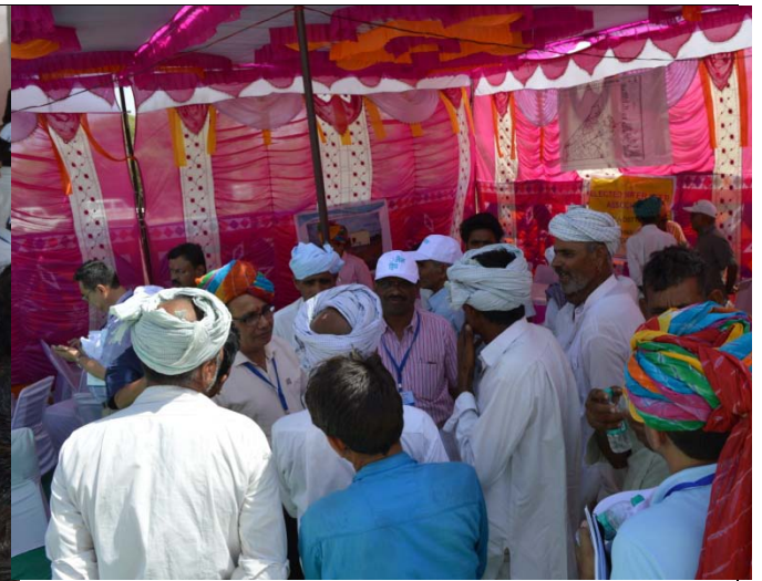
Discussion with WUA members