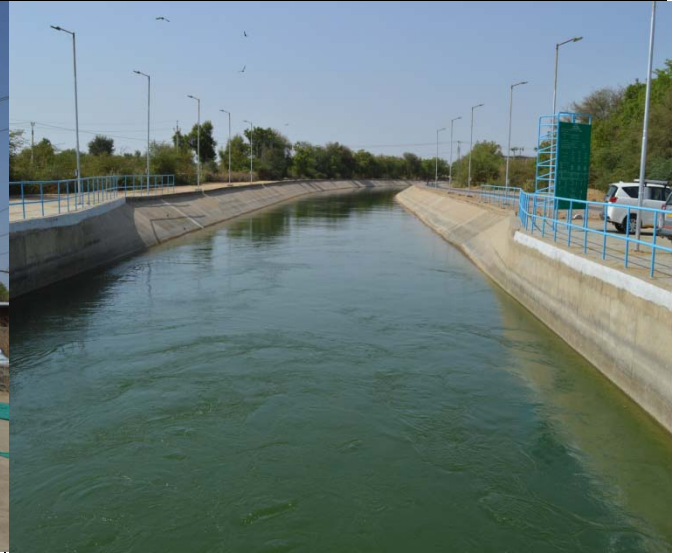
RD 7.88 KM of Narmada Canal