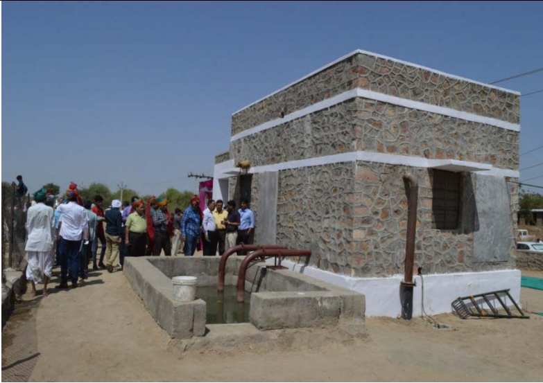
Visit to fully functional Pumping Unit (DDN-9T) on Dudhhwasan Minor