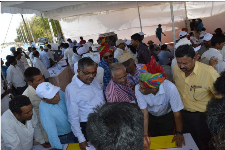
Discussion with State Government Engineers